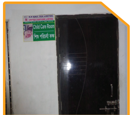
Child Care Room