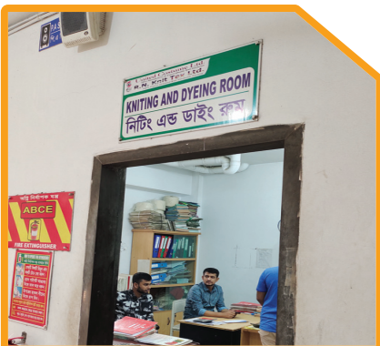
Knitting & Dyeing Section