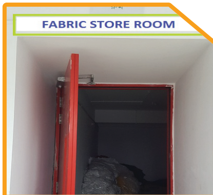
Fabric Store Room