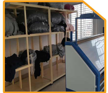
Fabric Check Table