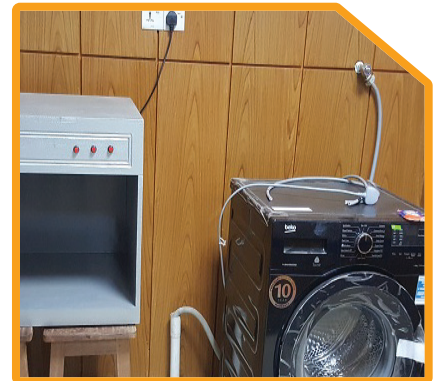
Washing & Light Check